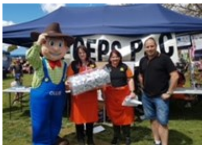
Our special guest "Ollie" from the City Centre