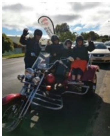
Some of the fun that was Happening!